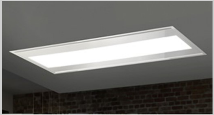
This photo is purely for information, it may not correspond to the selected version

Version 1200mm—White Panel & Stainless Steel Frame— AMF13 Motor