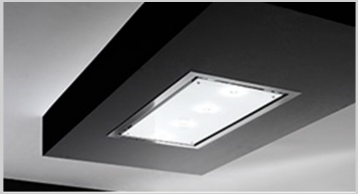
This photo is purely for information, it may not correspond to the selected version

900mm—Extra White Glass & Stainless Steel Frame— AMR10 Motor